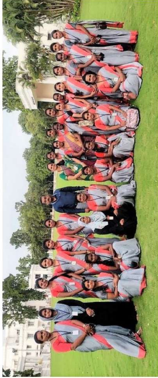
NSS Team at Raj Bhavan